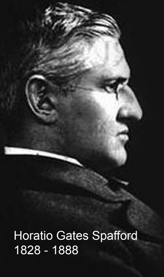
Horatio Gates Spafford 1828 - 1888