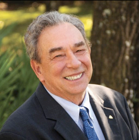
Robert Charles Sproul, Chosen by God.

Every choice that we make is free. Every choice we make is determined.