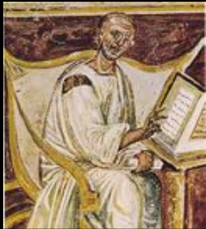
St. Augustine, de Verb. Apost. Serm. 20 354-430

I see the height; I cannot sound the depth.