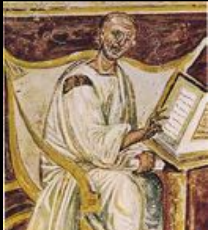
St. Augustine, de Verb. Apost. Serm. 20 354-430

[The apostle] Paul found rest, because he found wonder. He calls the judgments of God 'unsearchable;' and have you come to search them? He says that (God's) ways are 'past finding out,' and do you seek to find them out?"